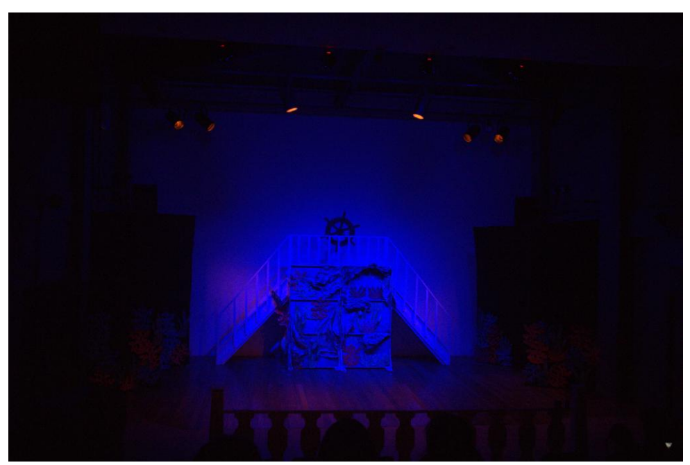
The stage of The Little Mermaid