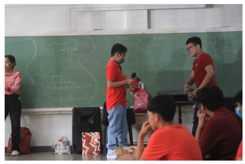
Grade 8 students exchanging gifts.

The final part of the program was the exchanging of gifts — students gathered around and eagerly waited to be called up to give their classmates a gift, as well as receive them. After exchanging gifts, the students now had to clean up their classrooms so that they would be ready for next year, as this was the last day the JHS students were attending school for the semester, and for the year 2023.