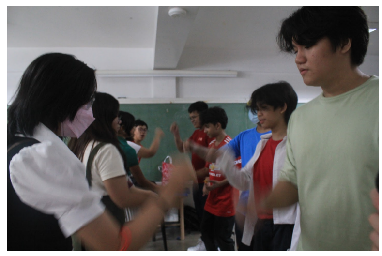
Grade 8 students playing bato bato pik.

levels like Bring Me , where you have to be the first one to bring an item requested by the host of the game, The Boat is Sinking , Hep-Hep Hooray , and Musical Chairs .